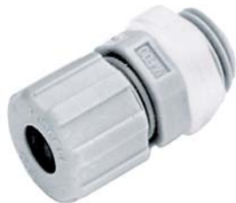
Gray Cord Connector