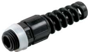
Black Cord Connector with Spiral